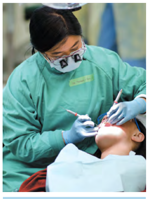
Office of Career & Professional Development