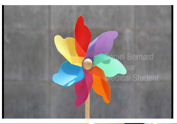
Multicultural Resource Center