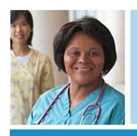
Synapse: UCSF Student Voices